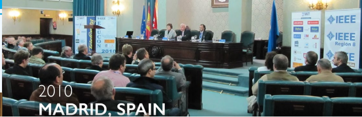
2010 MADRID, SPAIN